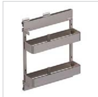
200mm / 7-7/8"