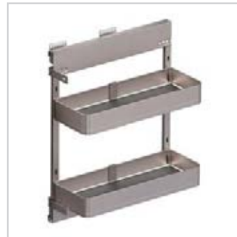
250mm / 9-7/8"