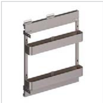
150mm / 5-7/8"

The Elan side-mounted pull-out system offers efficient storage for spices, bottles, and other small kitchen items. Designed for optimized cabinet utilization, it features smooth functionality and a clean, modern aesthetic. The champagne gold finish adds a refined accent, complementing a wide range of contemporary kitchen designs. Available in multiple sizes to accommodate various cabinet layouts and installation requirements.