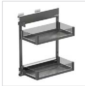
300mm / 11-3/4"