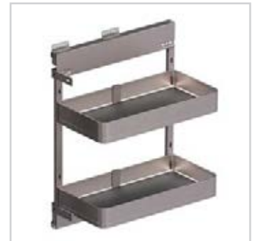
300mm / 11-3/4"