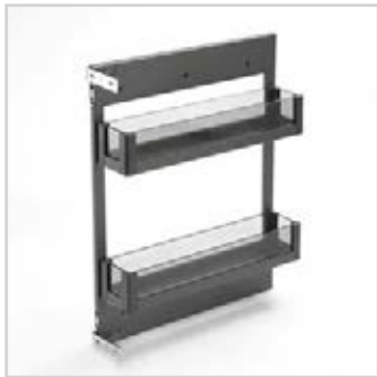
150mm / 5-7/8"

The Crystal pull-out system offers efficient storage for spices, sauces, and bottles within base cabinets. Constructed from durable steel with elegant glass sides, it features smooth sliding and soft-closing functionality. Designed for narrow cabinets, it maximizes space while maintaining a refined, modern appearance.