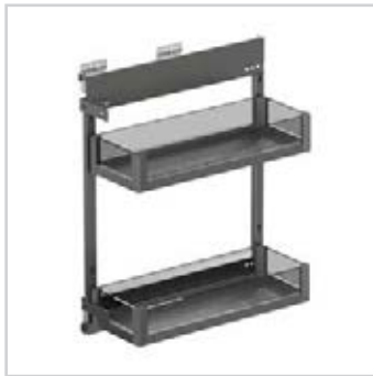
200mm / 7-7/8"